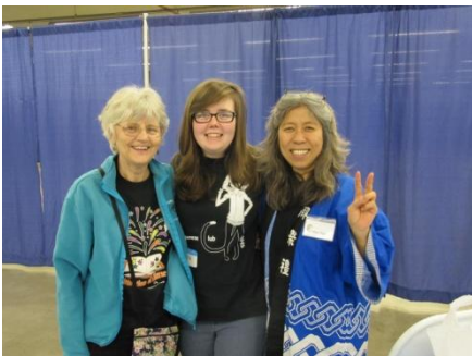
Hard working Threesome